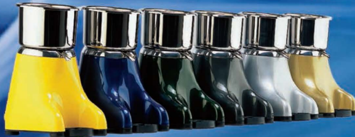
AK/6 ECO Orange Squeezer