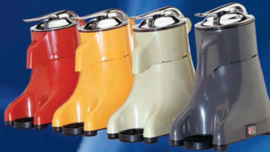
AK/6 RAL Orange Squeezer