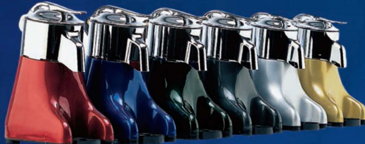
AK/7 AUT ECO Automatic Orange Squeezer